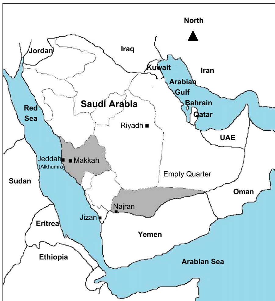
Figure 1 Map of Saudi Arabia showing the two provinces where Alkhumra virus infection is identified, Makkah province which includes Jeddah city (where Alkhumra district is located) and the holy city of Makkah, and Najran city.

used to detect Dengue IgM and IgG antibodies were Dengue group-specific, employing a common antigen for Dengue virus serotypes 1, 2, 3, and 4 (PanBio Ply Ltd, Australia). Anti-ALKV IgM antibody titers were determined by IgM antibody-capture ELISA, with an inactivated ALKV virus-infected cell slurry prepared using the same procedures previously described. 5,6 Anti-ALKV IgG antibody titers were determined by using ALKV virus-infected cell antigens in an ELISA format as described. 5,6