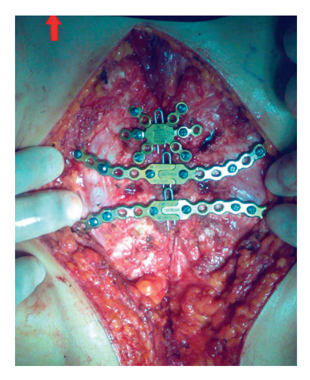
Fig. 3 (a). Intraoperative picture of the the titanium plate system.

The sternal fixation system using titanium plates was chosen because of its ideal application in such cases with deficient sternal bone. The length the screws were selected according to the sternal thickness. A star shaped titanium plate was used in the manubrium and two rows were applied to the third and fourth costal cartilages. Each plate on either side was fixed with multiple screws at predrilled sites (Fig. 3a, Fig. 3b). Postoperative course was smooth and the patient was discharged home well. The patient has been followed for more than one year with excellent results and full patient satisfaction.