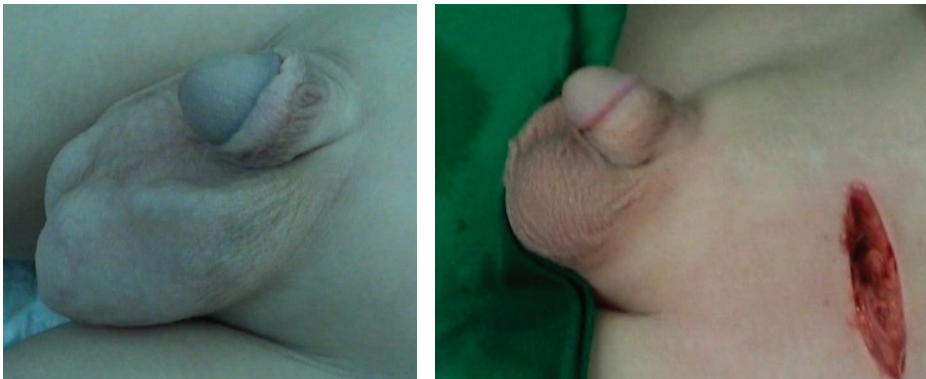
Fig. 1. Photograph for the Lt groin - (Left) after reduction of the Lt inguinal hernia showing the residual lobulated swelling; (Right) post-operative view showing the normal appearance of the Lt hemiscrotum.

A 3-year-old Saudi boy presented with a painless left inguinoscrotal mass which was increasing with straining and decreasing in size with lying down. There was no history of previous trauma to the region but with retrospective positive family history of cystic hygroma of neck and Lymphangioma circumscriptum of tongue in his cousin. On examination, there was left sided incomplete reducible inguinal swelling; however, spermatic cord felt significantly thickened when the hernia was reduced (Fig. 1). Testes were normal bilaterally. He was otherwise well, and there was no palpable inguinal adenopathy or similar lesions elsewhere. The patient came with an ultrasound report suggesting a picture of multiple lipomas of the spermatic cord. No further imaging studies were performed in our hospital and through lower inguinal transverse crease incision the area was explored. Hernial sac was found, dissected, transfixed and excised easily. There were multiple cystic lesions of varying sizes cysts between cord structures filled with clear fluid (Fig. 2) extending from inguinal canal down to involve the tunica vaginalis but not to the scrotal wall (Fig. 3). The mass was excised in its entirety including the tunica vaginalis (Fig. 4).