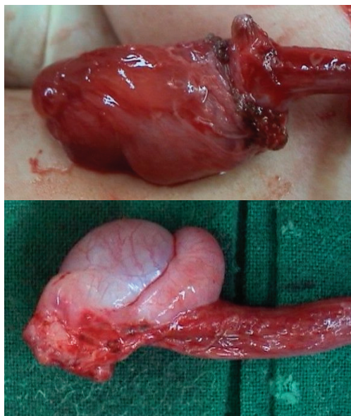
Fig. 4. Intra-operative photograph after separation of the mass from cord structures. (upper) Showing the involvement the tunica vaginalis with the cysts; (lower) excised tunica vaginalis with the cysts.

Histopathologically, it was a soft multicystic grayish tissue measuring 3 \times 3 \times 1 cm. Sections revealed congested fibrofatty tissue infiltrated with multiple dilated spaces lined by endothelial cells and filled with lymph and scattered lymphocytes. A picture consistent with cystic lymphangioma.