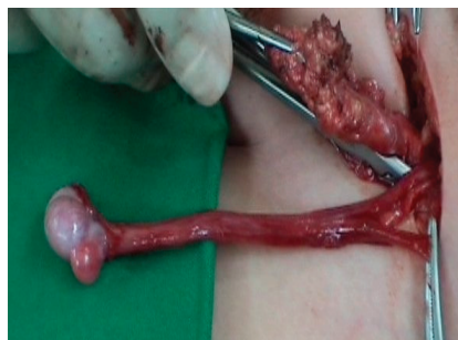
Fig. 3. Intra-operative photograph after separation of the mass from cord structures protruding from the inguinal ring but no further intra abdominal extension.